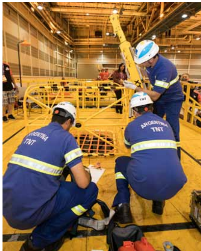
The Interamerican Sanitary and Environmental Engineering Association (Buenos Aires, Argentina) team TNT focused on preparing for the Safety Event during a special practice session hosted by the Louisiana Water Environment Association team, the Water Dawgs.

TNT repeated their training regimen before coming to New Orleans, but they were not able to acquire the same equipment used at WEFTEC, particularly the equipment used in the Safety Event, Bustamante said.