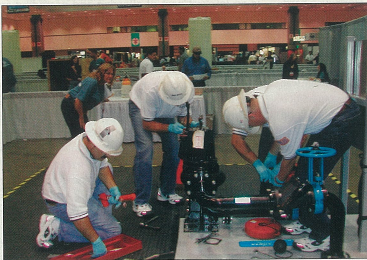
New Jersey's Cape Shore Workers turn wrenches on their way to victory in the ITT-Flygt Maintenance Event.