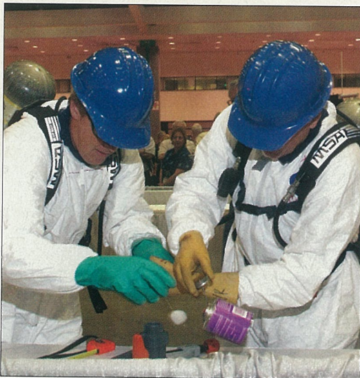
OSCAR & ASSOCIATES